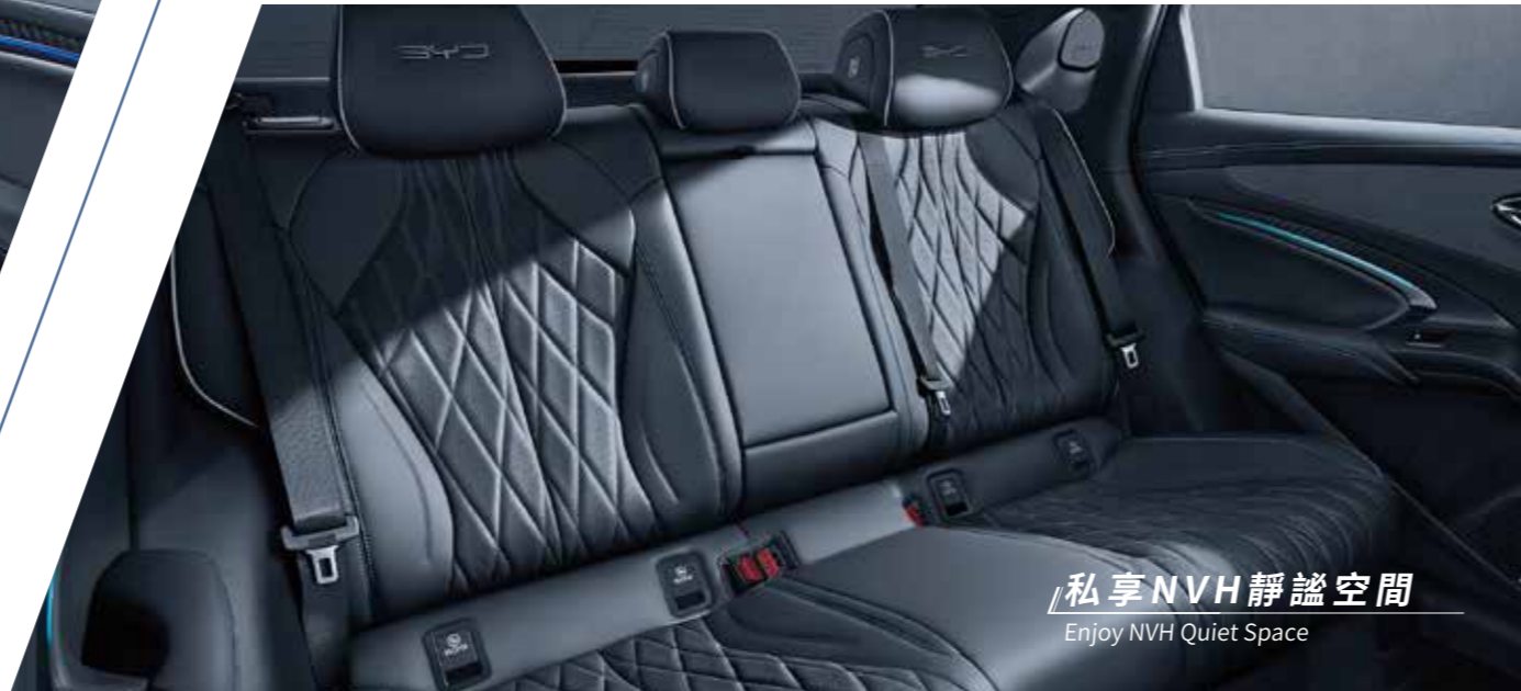
私享NVH靜謐空間 Enjoy NVH Quiet Space