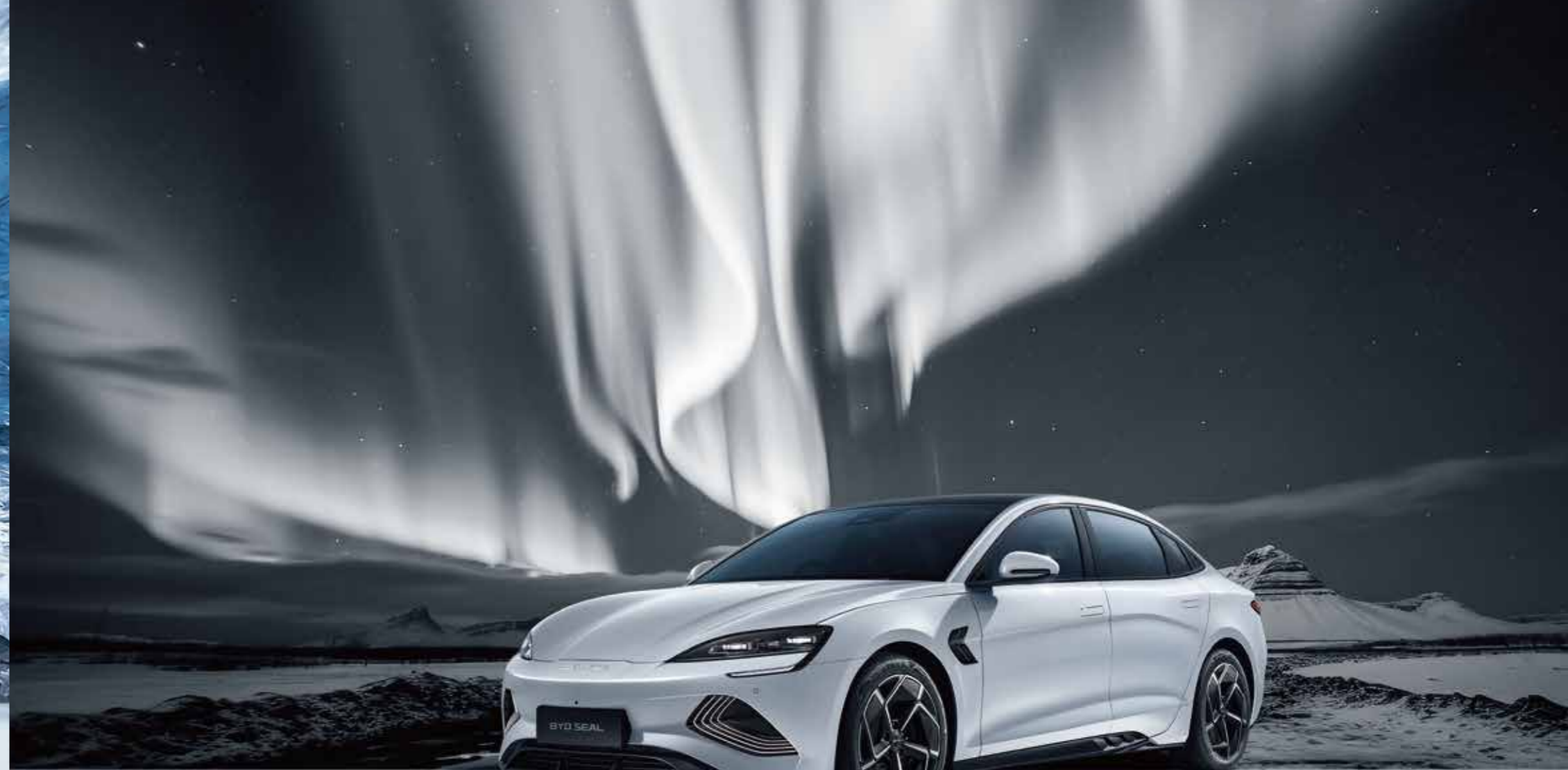
極光白 AURORA WHITE