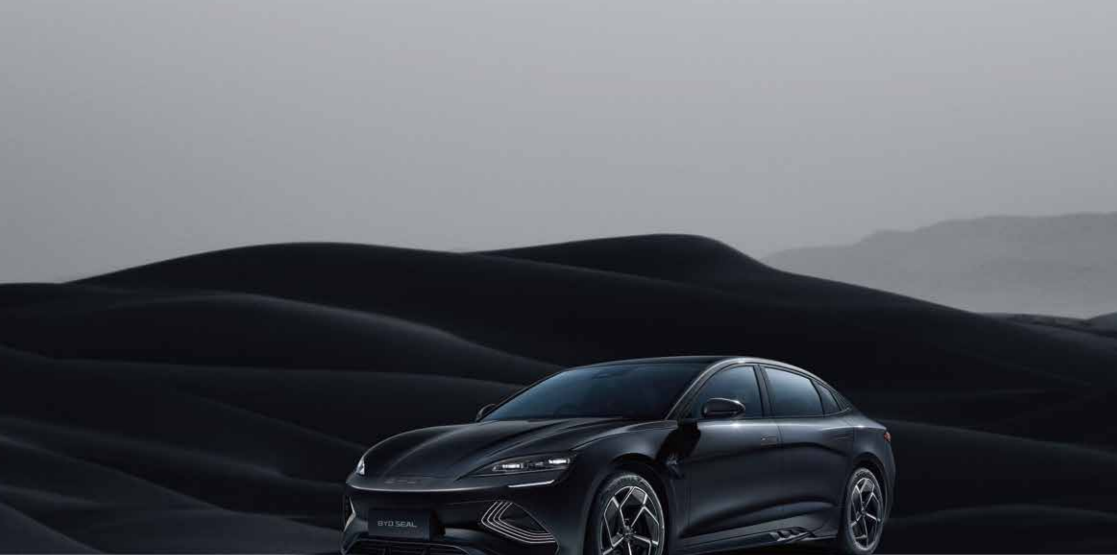
玄空黑 COSMOS BLACK