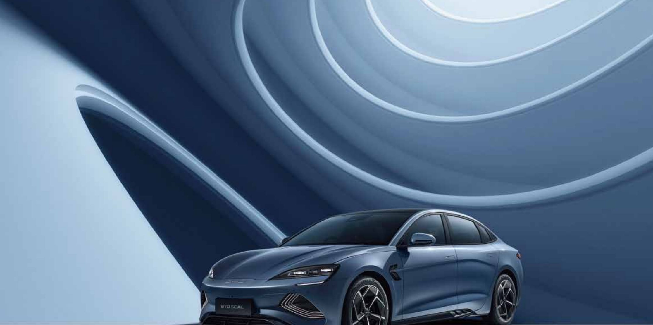
亞特蘭蒂斯灰 ATLANTIS GRAY