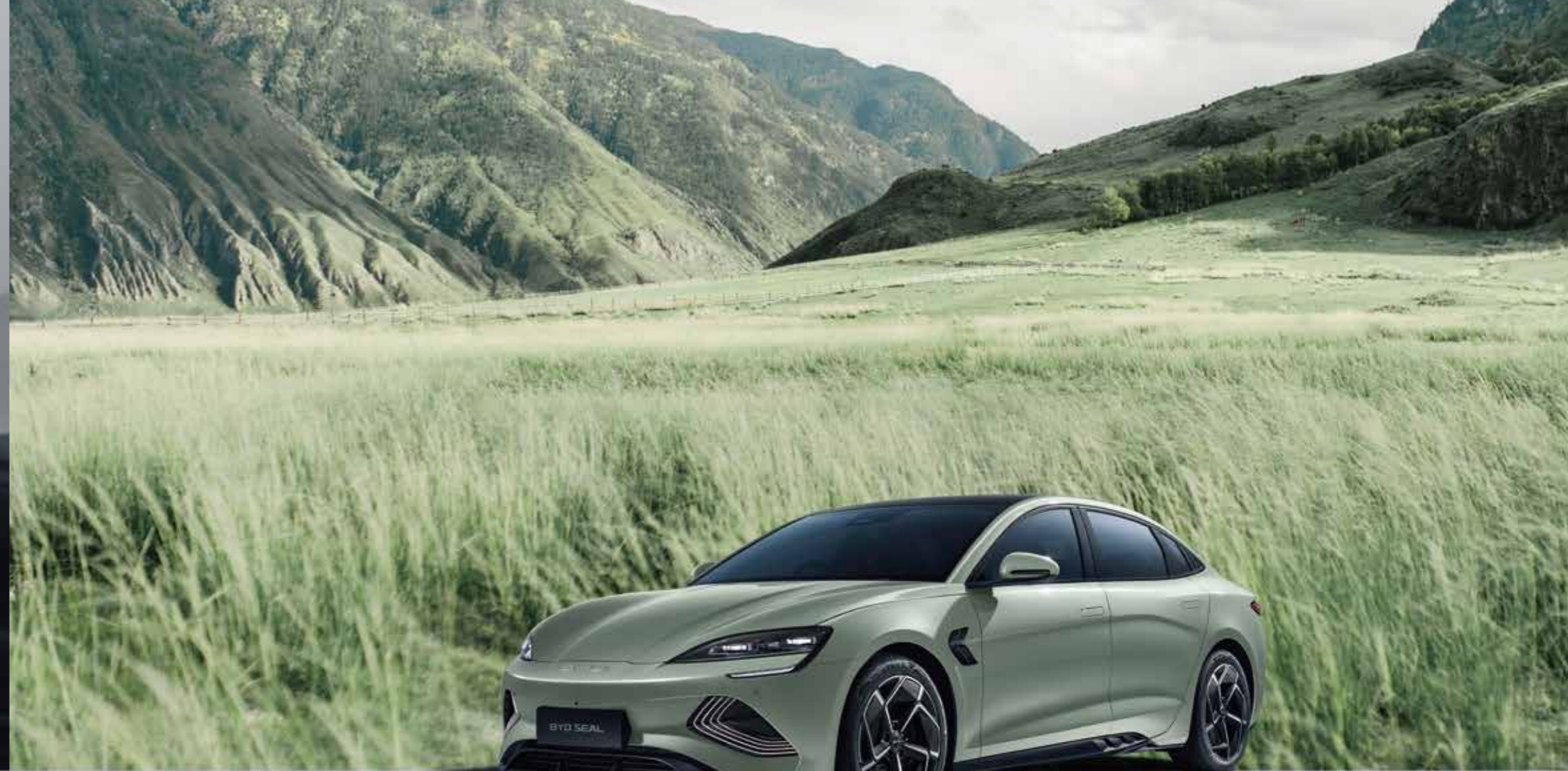
風卷草綠 MYSTIC GREEN