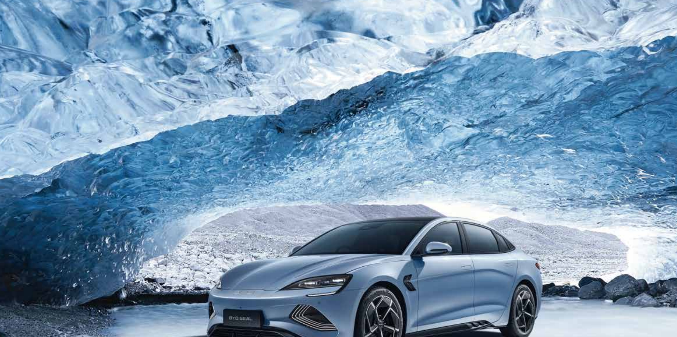
北冰藍 ARCTIC BLUE