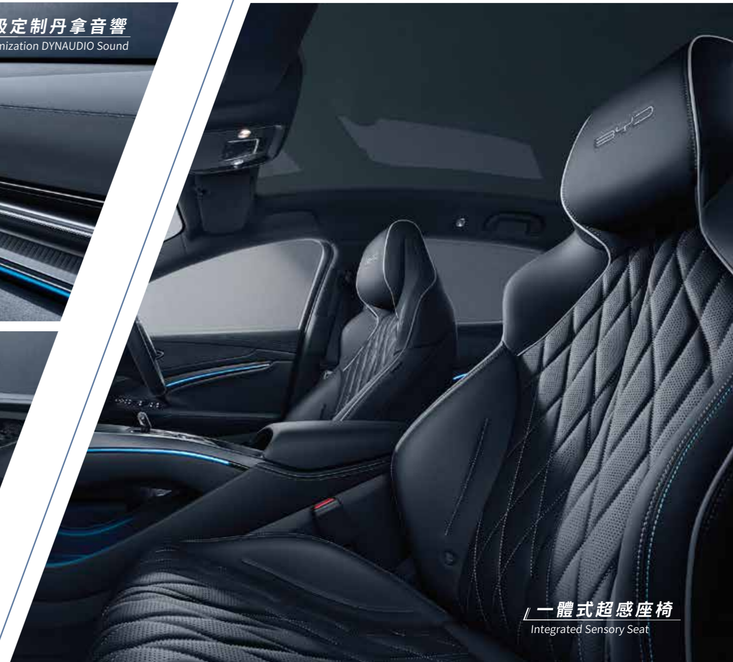
一體式超感座椅 Integrated Sensory Seat