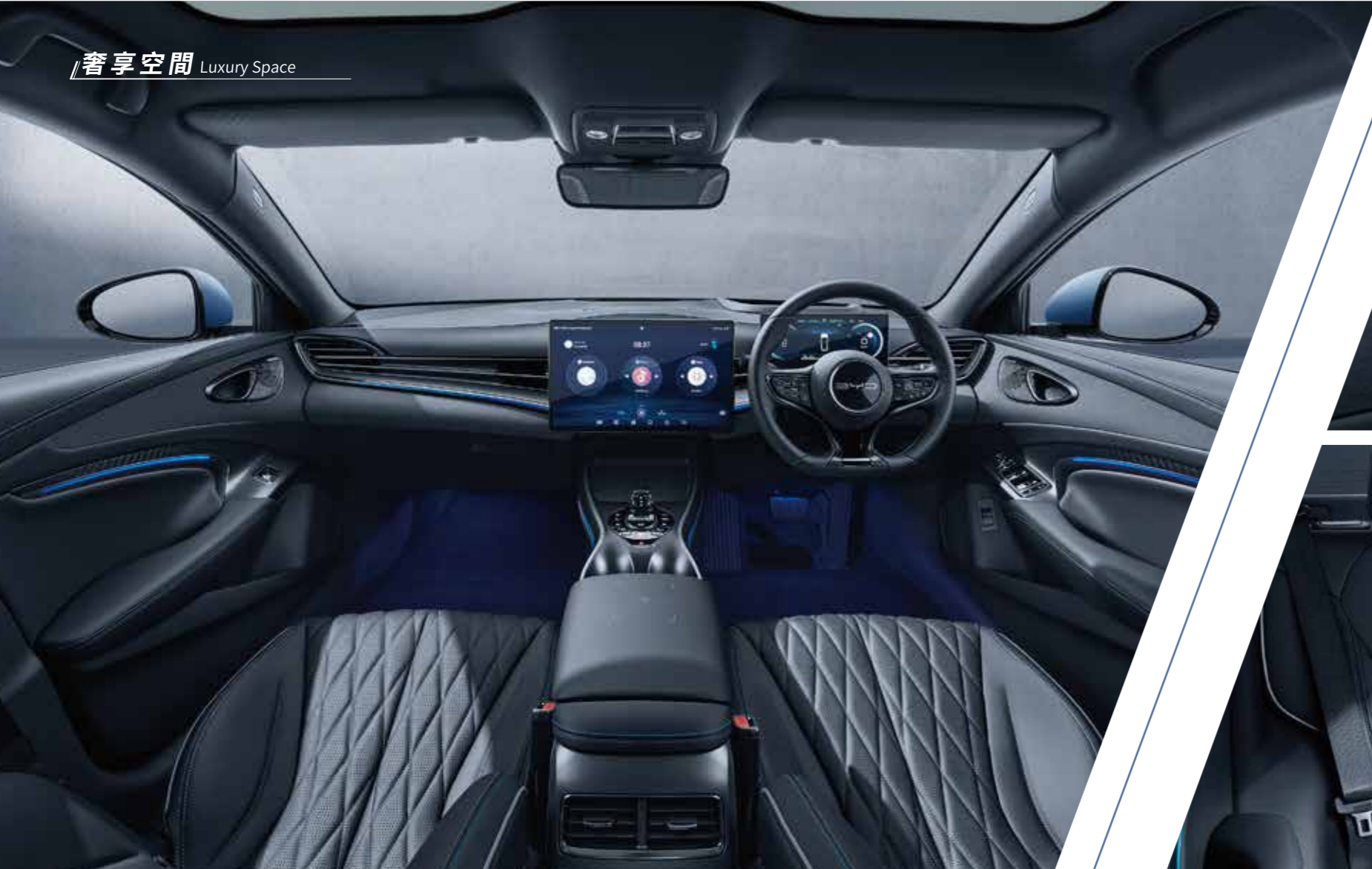
奢享空間 Luxury Space