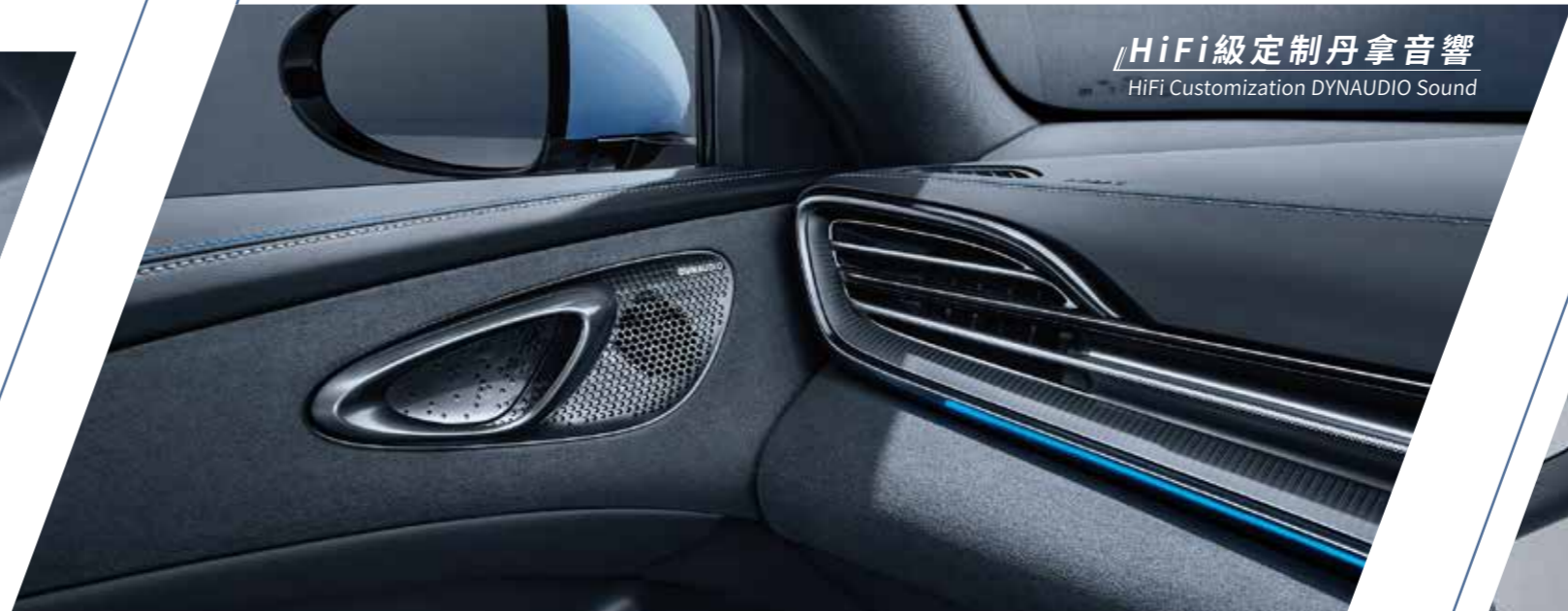
HiFi級定制丹拿音響 HiFi Customization DYNAUDIO Sound