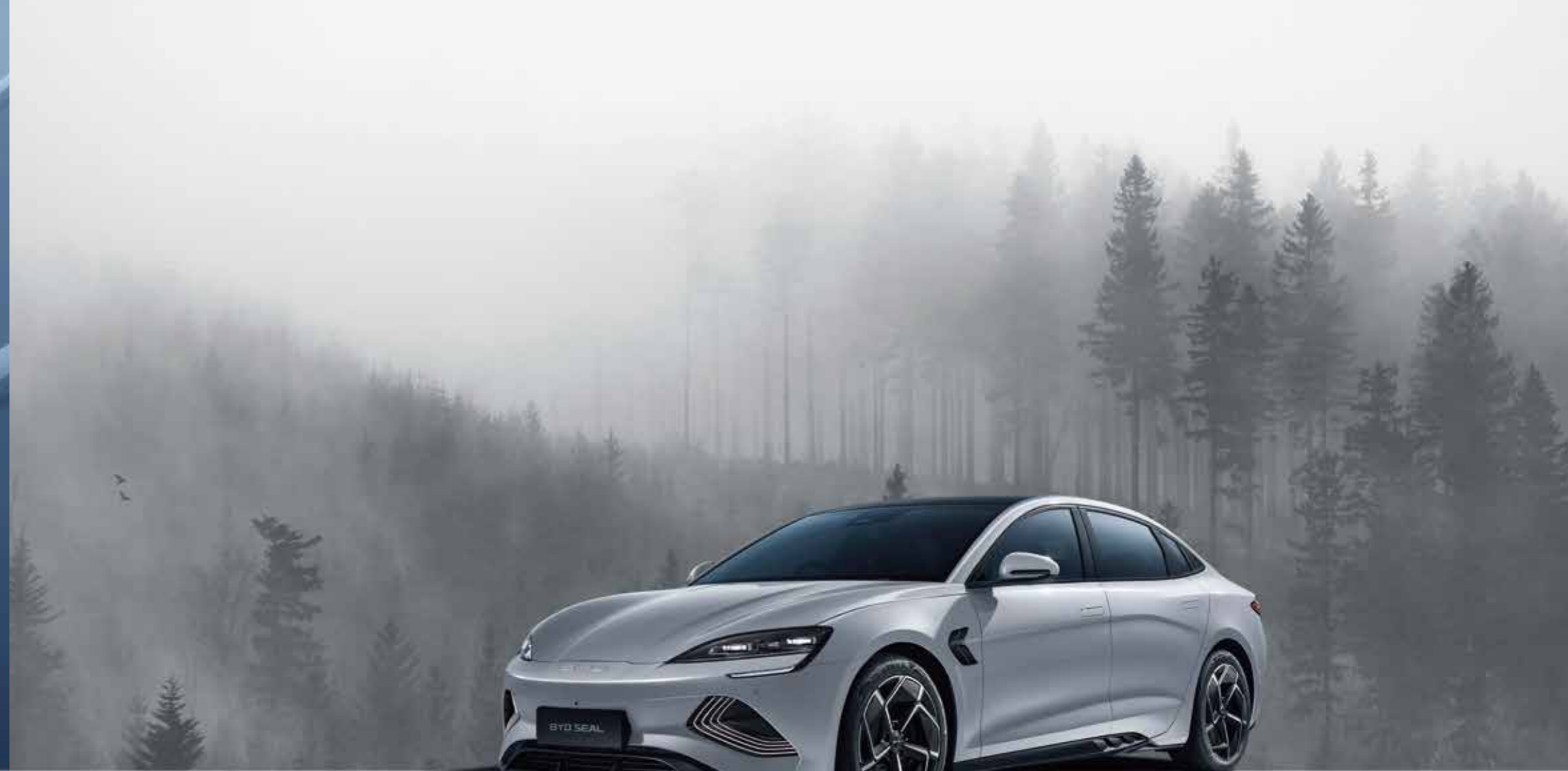
迷迭灰 SHARK GRAY